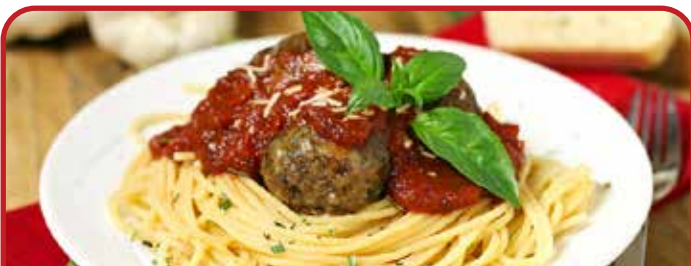
Plate Sharing Fee For All Items 3.00

BROILED FISH DINNER 18.95 Fresh Haddock Broiled with lemon & white wine, Served with choice of potato, coleslaw & tartar sauce. Add Side House Salad + 2.00 Add Side Caesar Salad + 2.50